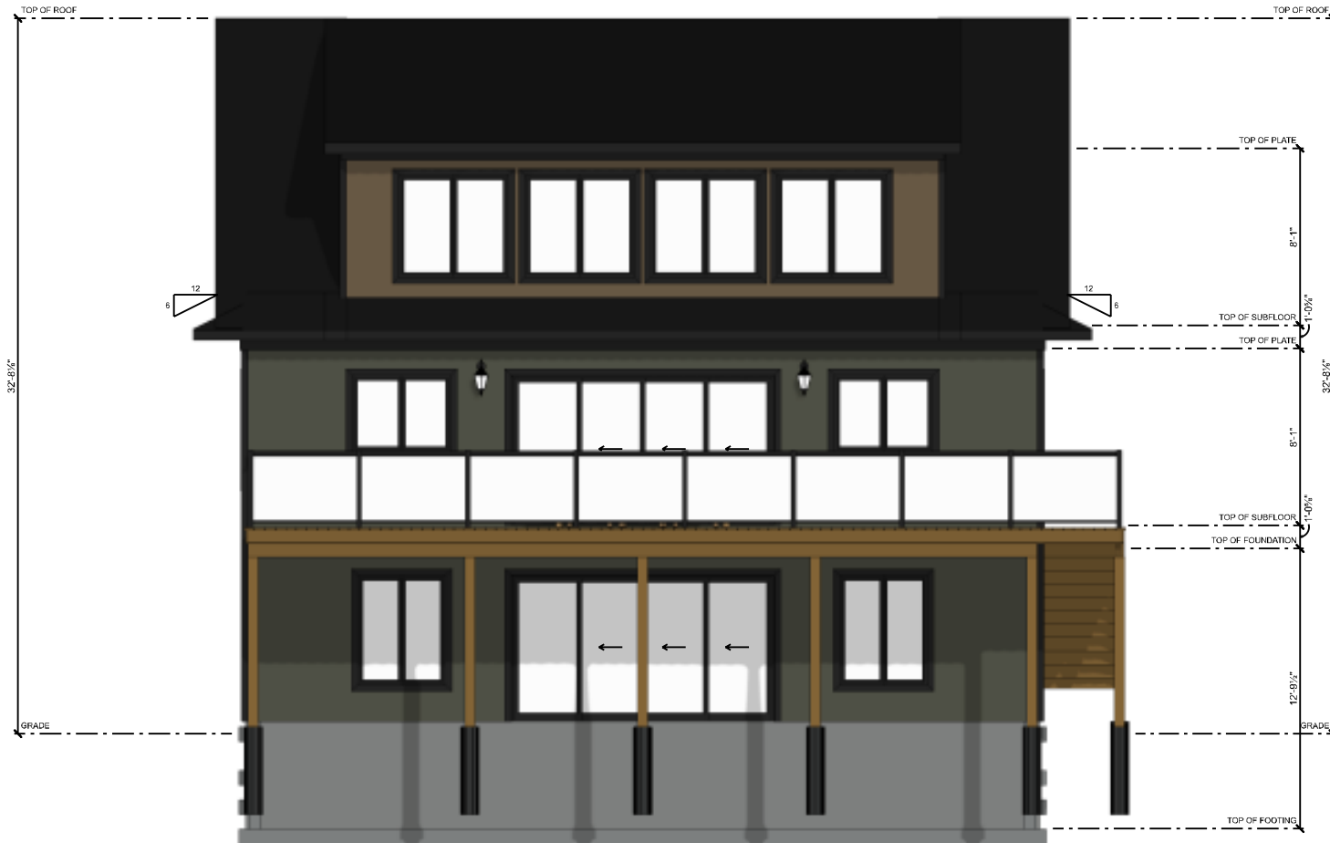
REAR ELEVATION SCALE: 1/8" = 1'-0"

PRELIMINARY DESIGN NOT FOR CONSTRUCTION THIS IS A CONCEPT DRAWING AND FURTHER STRUCTURAL COMPONENTS MAY BE REQUIRED DURING WORKING DRAWING STAGE