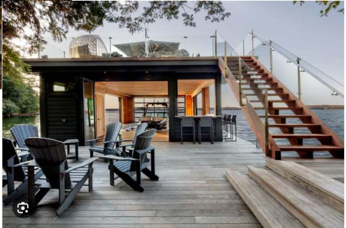
Proposed Boathouse – Concept Vision Pictures (only)